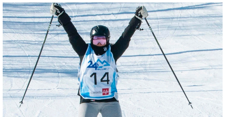
24H Blue Mtn

Want to learn more about becoming a Hospital Hero or share your idea with us? Contact Shania Paterson at patersons@cghm.on.ca or (705) 444-8645 today!