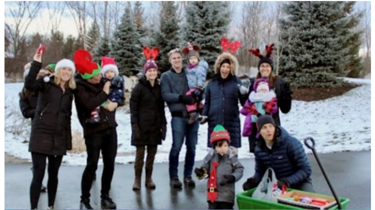
Collingwoodlands Neighbourhood Santa Claus Parade

All funds raised from your event will support the most critical equipment and technology needs of Collingwood G&M Hospital where it's needed most.